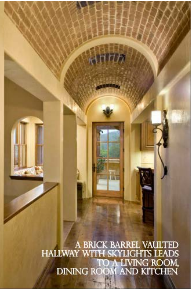
A BRICK BARREL VAULTED HALLWAY WITH SKYLIGHTS LEADS TO A LIVING ROOM, DINING ROOM AND KITCHEN.